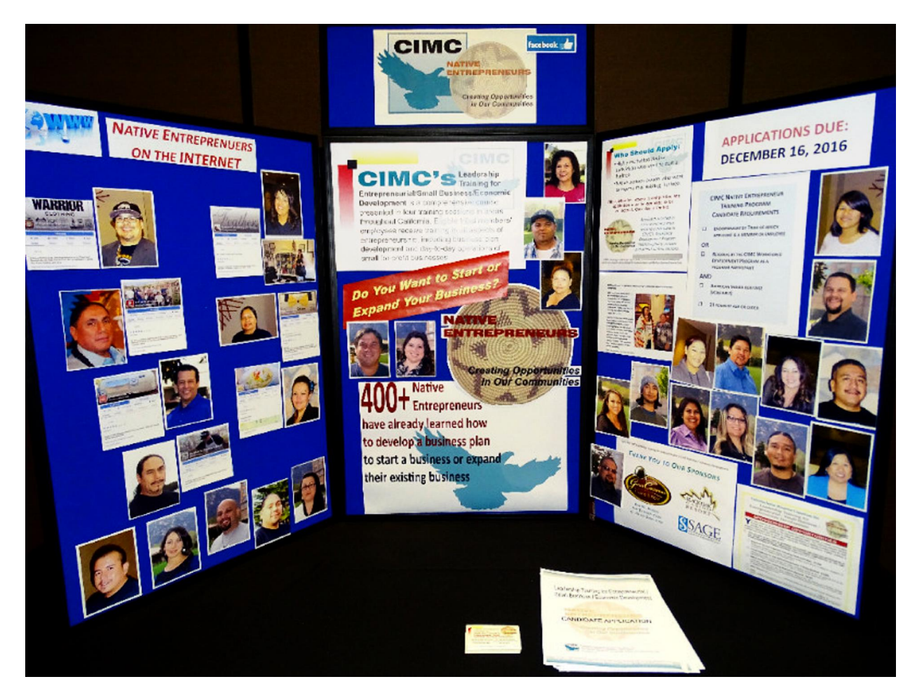
CIMC has announced that the 17th session of the <u>CIMC Leadership Training for Entrepreneurial / Small Business / Economic Development</u> will begin in January 2017. Applications are due December 16, 2016.

The CIMC Leadership Training for Entrepreneurial/Small Business/Economic Development is a comprehensive course provided to tribal members/employees through a series of workshops held in different geographic areas throughout California. The training is held in four sessions (2-3 days each month for four consecutive months). Students must commit to attending all four sessions.