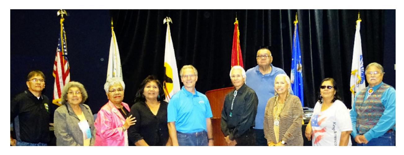
Current CIMC Board of Directors (as of November 5, 2016)