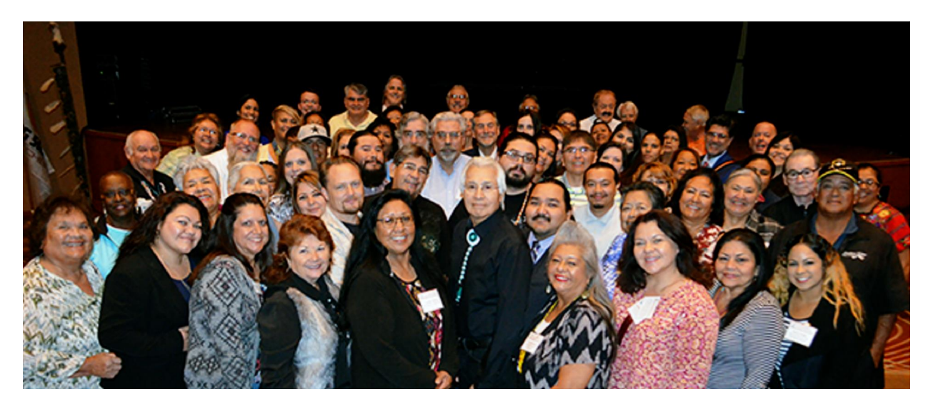
California Tribal Leaders and CIMC Delegates at the Special Tribal Consultation Session with the U.S. Census Bureau - November 4, 2016